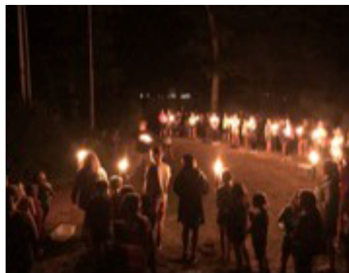
Closing ceremony Camp Corral

Having international staff not only allows young adults from other countries to experience American culture, traditions, and way of life, but for our campers to learn theirs. This past summer we had our first international camper from China adding a whole new chapter in our program. In 2020 we plan to host a much larger group of children from Spain for three weeks of overnight camp. We have also developed relationships with several specialty camps who now call Camp Lakotah home. Camp Corral, a national summer camp for military children whose parent/s have become injured, ill, or killed while serving our country. Camp Kesem, another national summer camp for children, serves children whose parent has been treated or is in treatment for cancer. Badger Youth Camp is a summer camp for children of the Wisconsin National Guard and Camp HALCYON, an adult camp created by past Alumni. We are proud to have so many people from all around this wonderful world and representing so many worthwhile missions calling Camp Lakotah home.